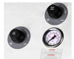
STEAM AND DEGREASER VOLUME CONTROL