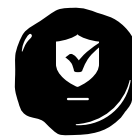
BOILER TANK LIFETIME WARRANTY