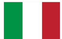
MADE IN ITALY